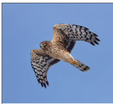
Northern Harrier